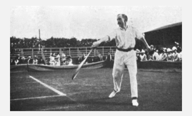
A player at Wimbledon in 1901

Born: 29 May 1867 <u>Died:</u> 8 January 1939 (aged 72) <u>County:</u> Dublin <u>Occupation:</u> Dentist Sporting Highlights: